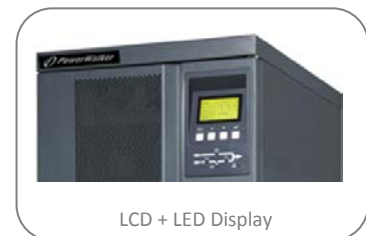
LCD + LED Display